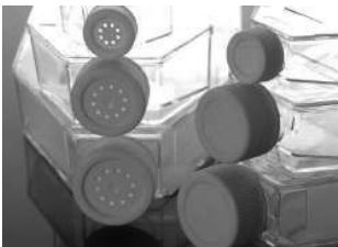
Yellow caps for non-treated flasks

NEST cell culture flasks are available in cell growth areas ranging from 25cm 2 to 225cm 2 . Tissue culture treated or non-treated flasks available with a vent cap or plug seal cap to meet your requirements. Vacuum plasma tissue culture treated provides optimum cell adherence. Non-treated flasks utilize yellow caps to be different from TC flasks which have teal caps. They are for suspension cell growth.